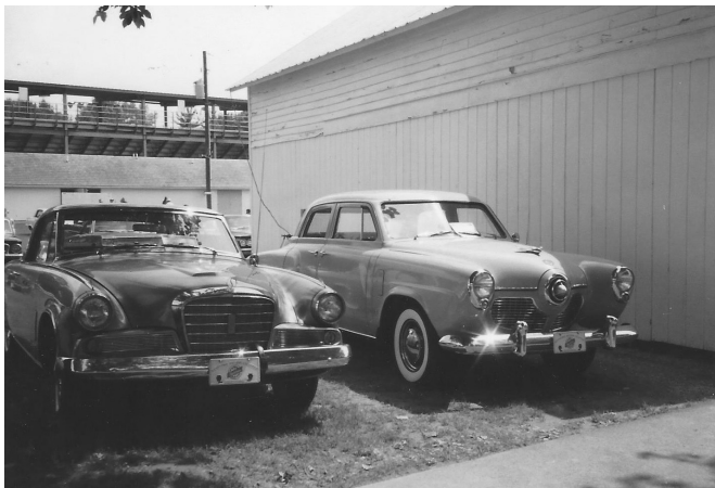
1964 Hawk and 1950 Champion

Studebaker was America's oldest manufacturer of vehicles, building wagons since 1850. The South Bend, Indiana, company was known for its low-priced Erskine and large President Eight during the 1920s. It built smaller Dictators and Commanders and large classic Presidents during the 1930s. Following 1941, it manufactured defense contract airplane engines, trucks and Weasel personnel carriers. Its post-war offerings benefitted from Raymond Loewy Studio's design with low