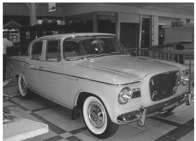
1960 Studebaker Lark

Years ago people made fun of the Studebaker, not knowing if it was coming or going, due to the radical post-war Loewy design. Now it draws